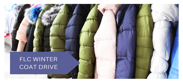
FLC Mobile Banquet Winter Coat Drive

Many thanks to all who donated to the Care Corps/ LifeHouse food drive. We reached and surpassed our goal of $6500. In total, FLC donated over 1300 pounds of food to the pantry, $6764 to the Retire-Path drive, and $295 to LifeHouse from our Thanksgiving offering. What great support to a much needed community ministry partner.